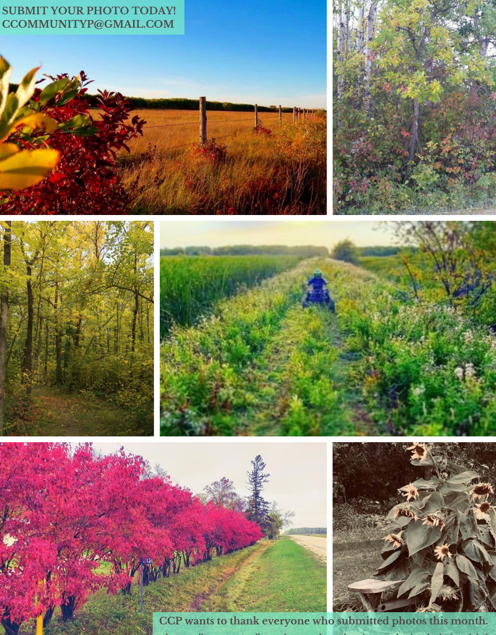
photo credit goes out to all our photographers , there is so much talent in the Interlake!